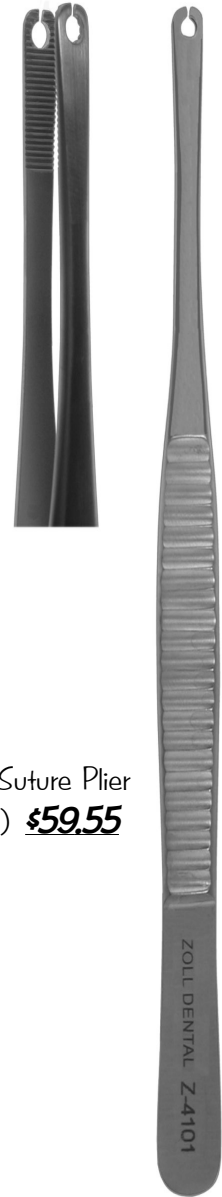
Straight Suture Plier (Z-4101) $59.55