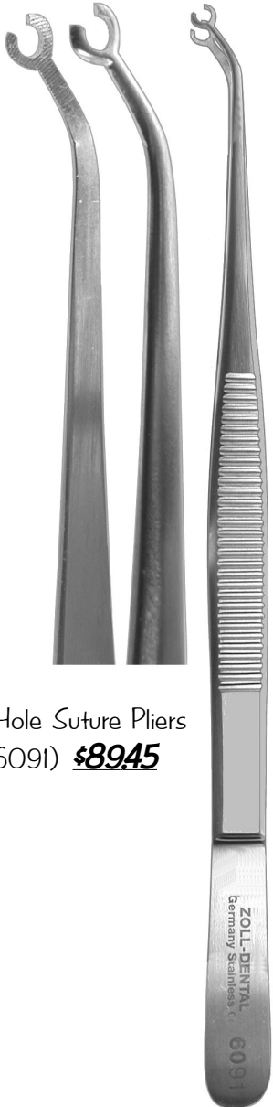
Large Hole Suture Pliers (Z-6091) $89.45

Suture Pliers are used to line-up and bring together two pieces of tissue and then to run the suture through the hole in the plier.